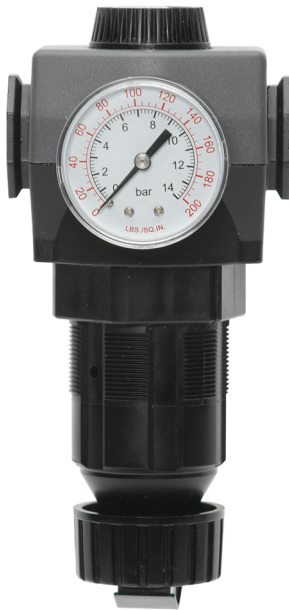
Model Shown: R380-6G